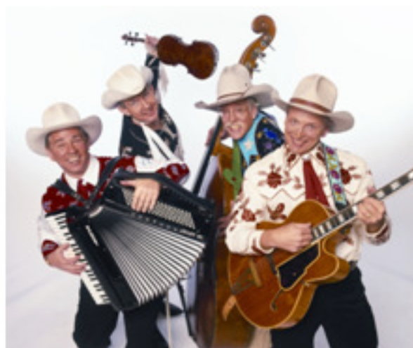
Riders in the Sky August 23 - tickets $25