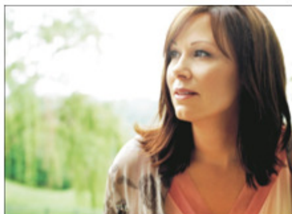
Suzy Bogguss March 16-tickets $25